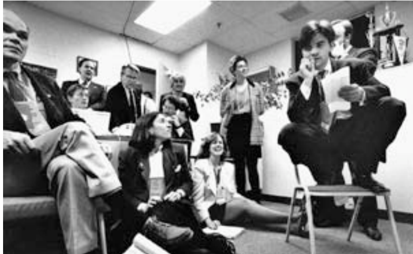
The campaign team