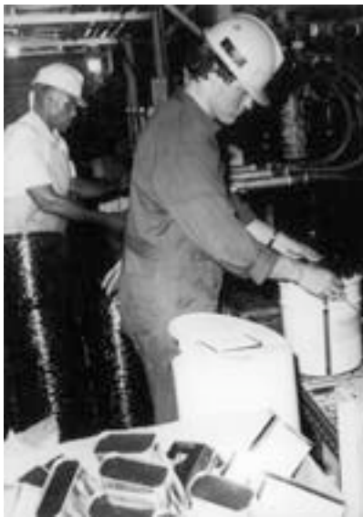
My workday at the Tosco plant