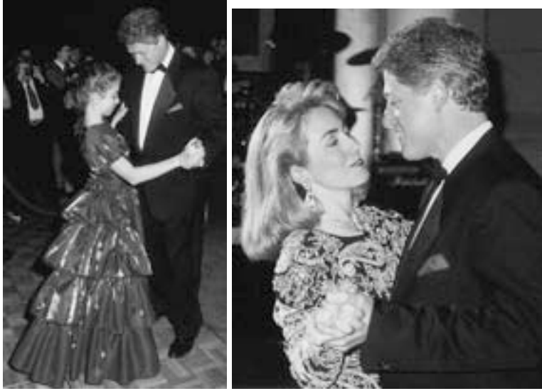
Dancing with Chelsea and with Hillary at the Governor's Inaugural Ball, January, 1991