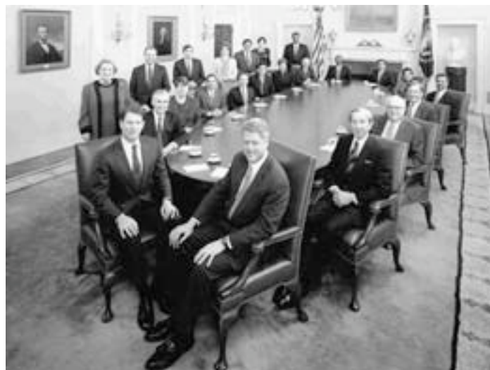
Al Gore and I with the cabinet: (standing, from left) Madeleine Albright, Mack McLarty, Mickey Kantor, Laura Tyson, Leon Panetta, Carol Browner, Lee Brown; (seated, from bottom left) Lloyd Bentsen, Janet Reno, Mike Espy, Robert Reich, Henry Cisneros, Hazel O'Leary, Richard Riley, Jesse Brown, Federico Peña, Donna Shalala, Ron Brown, Bruce Babbitt, Les Aspin, and Warren Christopher