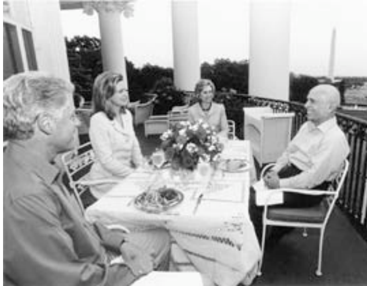
Our friends Queen Noor and King Hussein join Hillary and me on the Truman Balcony.