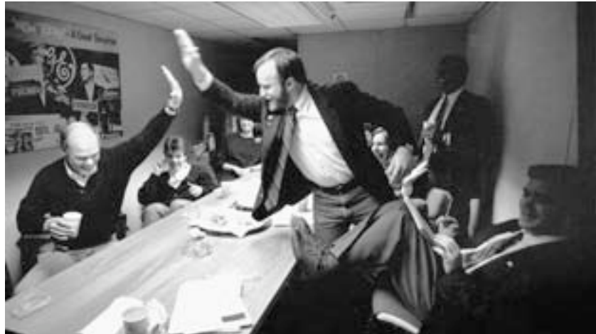
In the "war room" James Carville and Paul Begala high five