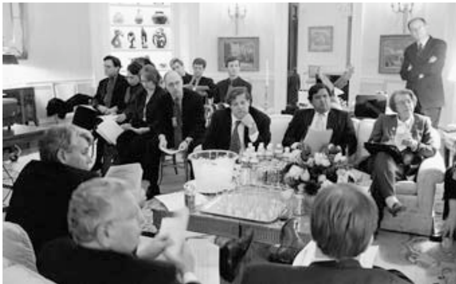
A strategy meeting in the Yellow Oval Room