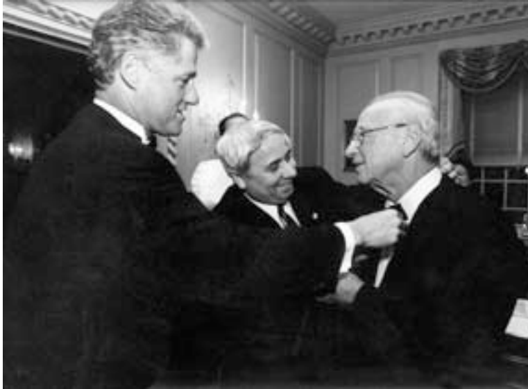
Straightening Prime Minister Yitzhak Rabin's tie. It would be our last time together.