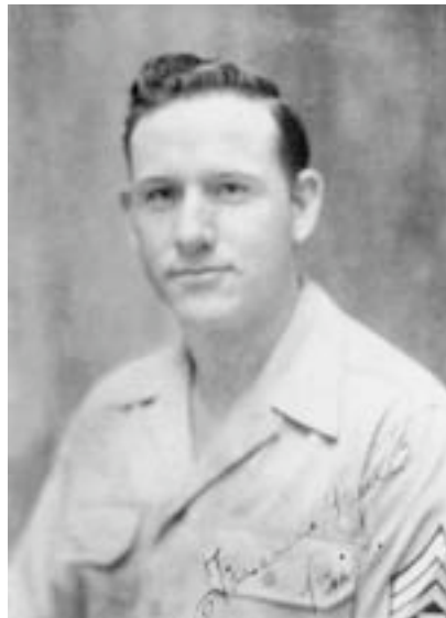
My father, William Jefferson Blythe, 1944

On my last day in the governor's office, after taking a picture of ten-month-old Chelsea sitting in my chair holding the telephone, I went up to the legislature to give my farewell address. I recounted the progress we'd made, thanked the legislators for their support, and pointed out that we still had America's second-lowest tax burden and that, sooner or later, we would have to find a politically acceptable way to broaden our revenue base to make the most of our potential. Then I walked out of the Capitol and into private life, a fish out of water.