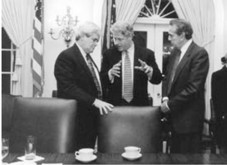
With Republican leaders Representative Newt Gingrich and Senator Bob Dole in the Cabinet Room