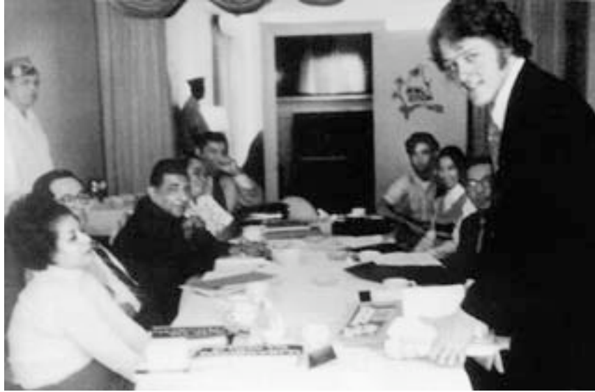
Campaigning for George McGovern in San Antonio, Texas, 1972