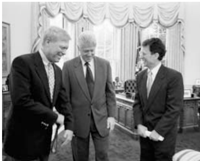
With Democratic leaders Representative Richard Gephardt and Senator Tom Daschle in the Oval Office