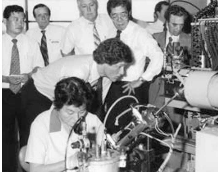
At the Sanyo Electric plant in Japan