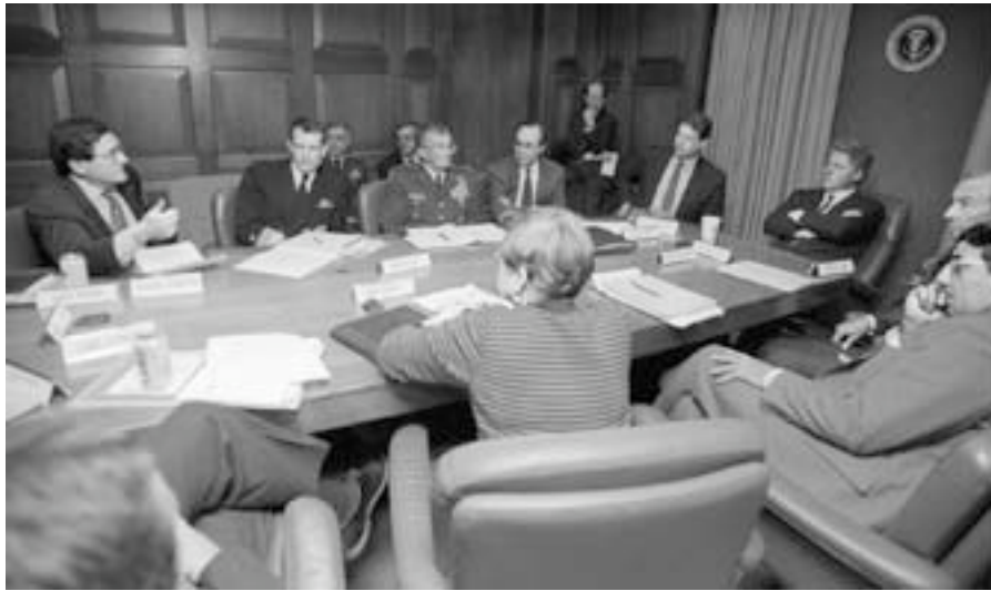
Bosnia briefing in the White House Situation Room