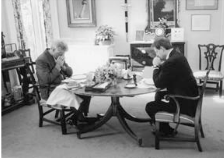
Al and I praying at our weekly lunch