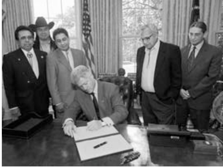
Signing an executive order with representatives of Native American Tribal Governments