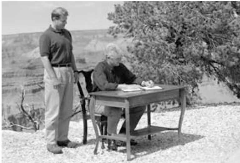
Al and I on the edge of the Grand Canyon establishing the Grand Staircase–Escalante National Monument