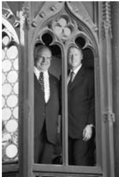
With German chancellor Helmut Kohl at Warburg Castle