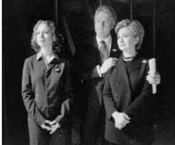
February 7, 2000: Hillary announces her campaign for the Senate