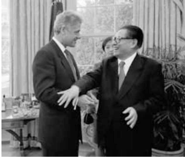
With Chinese president Jiang Zemin in the Oval Office