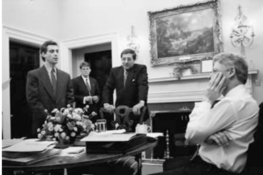
Rahm Emanuel and Leon Panetta brief me in the Oval Office dining room.