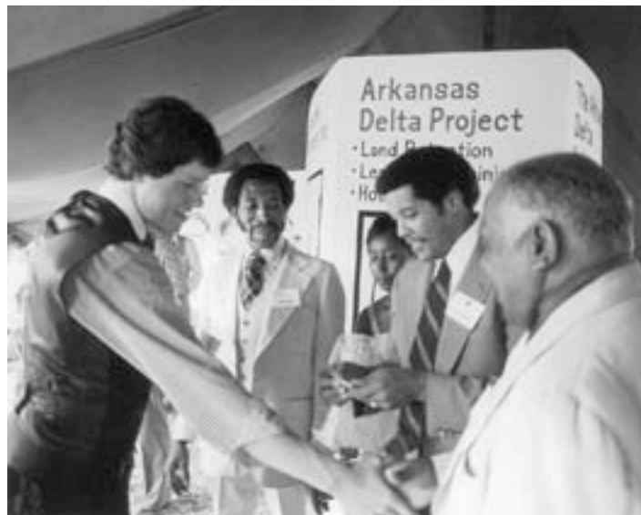
Visiting Arkansas Delta Project leaders, with whom I worked to bring economic development to their region