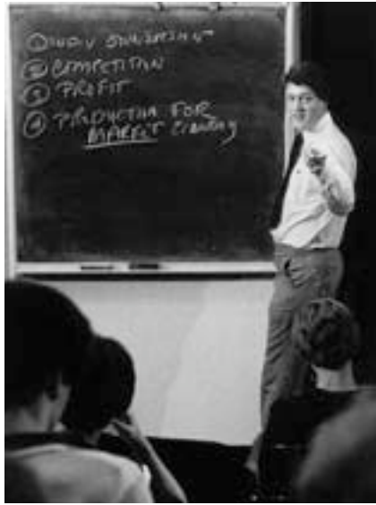
Teaching at the University of Arkansas Law School, Fayetteville