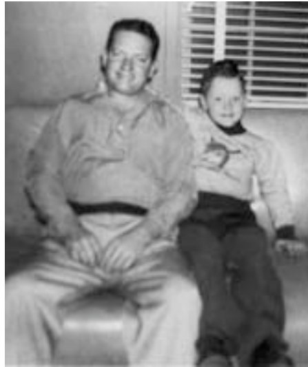
Daddy and I at home in Hope, 1951