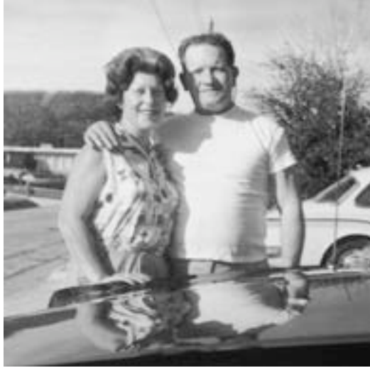
Mother and Daddy, 1965