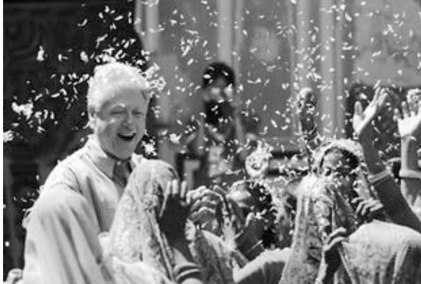
Being showered with rose petals in a traditional ceremony in Naila, India