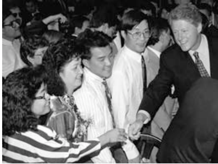
Greeting supporters in Los Angeles