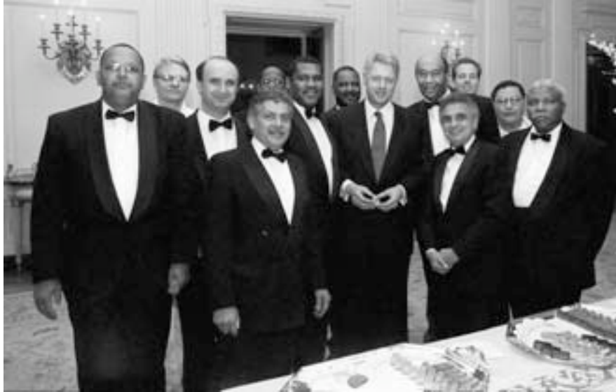
With the White House residence butlers and staff