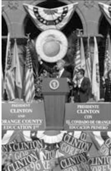
Promoting education at an event in California