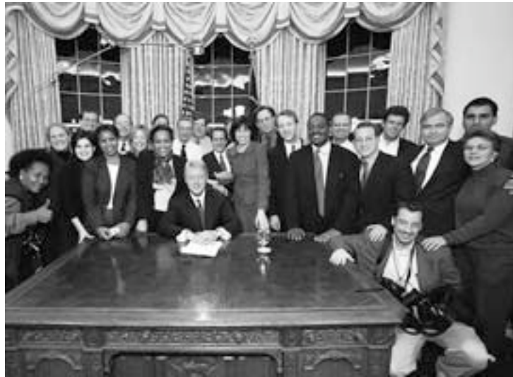
Celebrating with my staff after my final address to the nation