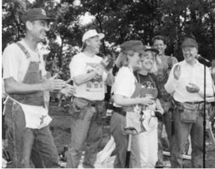
Hillary and I, Tipper and Al Gore, President Jimmy Carter, and (at left) Habitat for Humanity founder Millard Fuller celebrate Tipper's and my joint birthday.