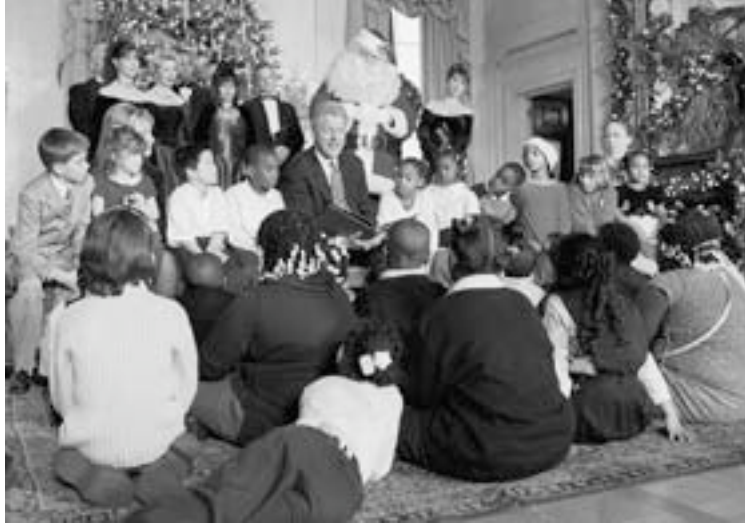
Reading “’Twas the Night Before Christmas” to children in the East Room with Hillary and Chelsea