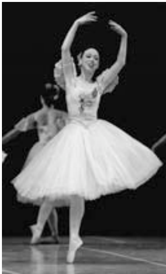
Chelsea in The Nutcracker