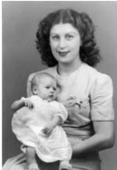
Mother and I