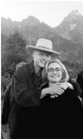
With Hillary in Wyoming