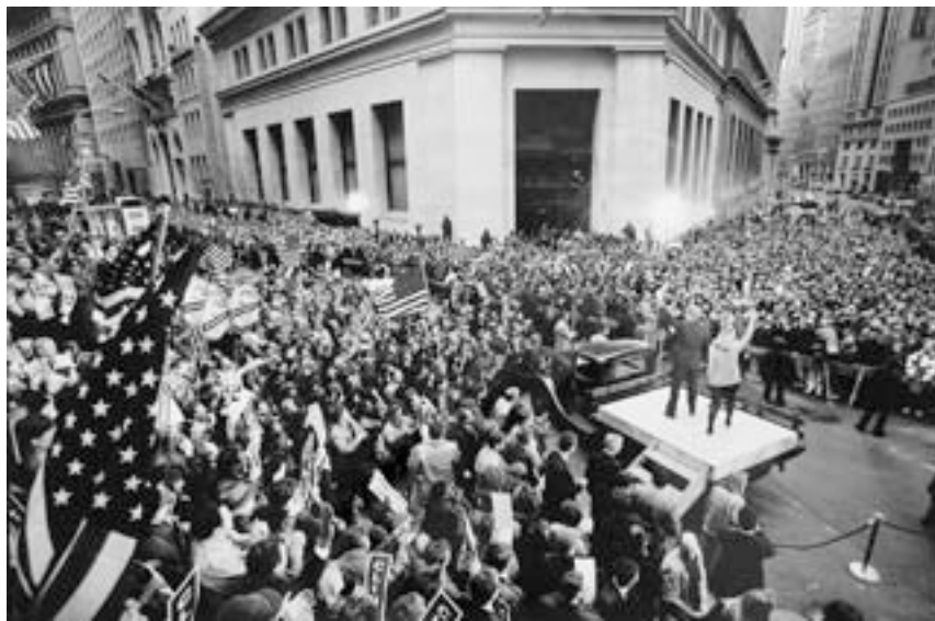
Wall Street turns out for Hillary and me.