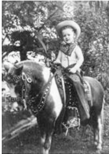
Here I am in 1949. Above, far left: at my father's gravesite on the afternoon Mother left for nurse's training in New Orleans; above, center: in our backyard; above, right: posing for a photo for Mother's Day