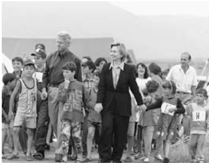
Hillary and I touring a Kosovar refugee camp in Macedonia