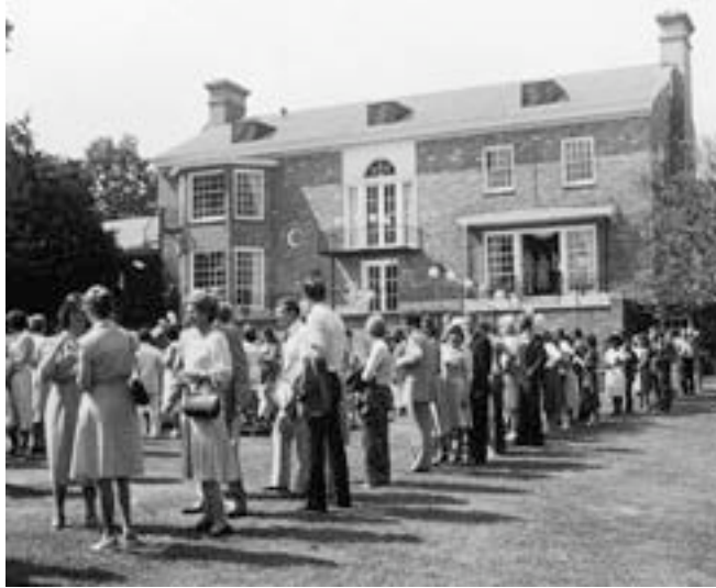
Parents and students at the Governor's Mansion for High School Honors Day, celebrating the valedictorians and salutarians of Arkansas high schools