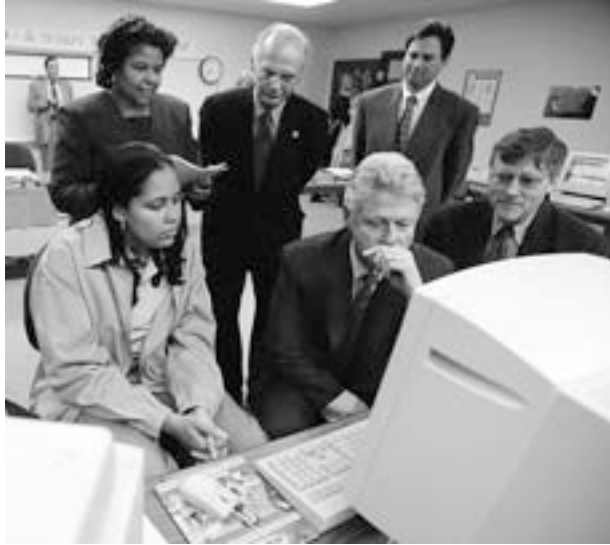
Bringing the Internet into America's classrooms, with Dick Riley