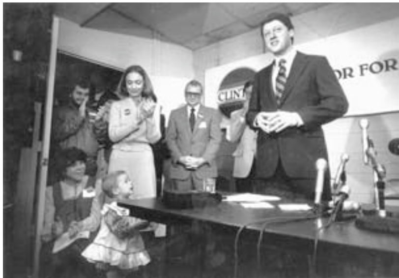
My announcement for governor in 1982. Hillary inscribed the picture "Chelsea's second birthday, Bill's second chance."