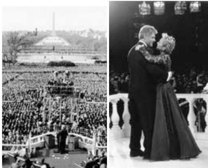
The inauguration and an inaugural ball, January 20, 1993