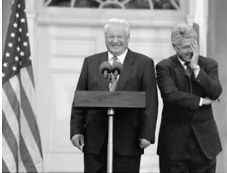
Russian president Boris Yeltsin and I in Hyde Park, New York