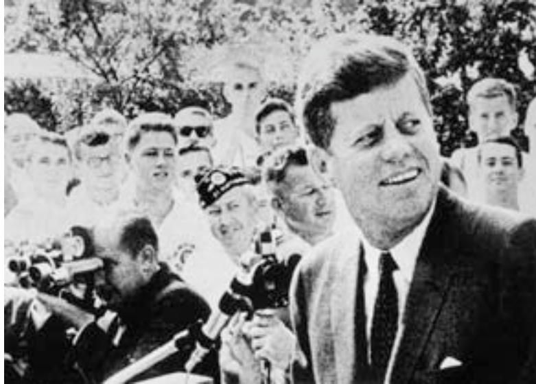
I'm in the front, right behind the photographer, as President John F. Kennedy addresses the Boys Nation delegates in the Rose Garden on July 24, 1963.