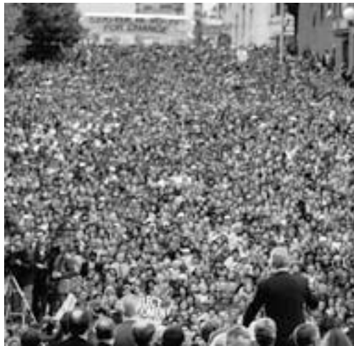
Rally in Seattle