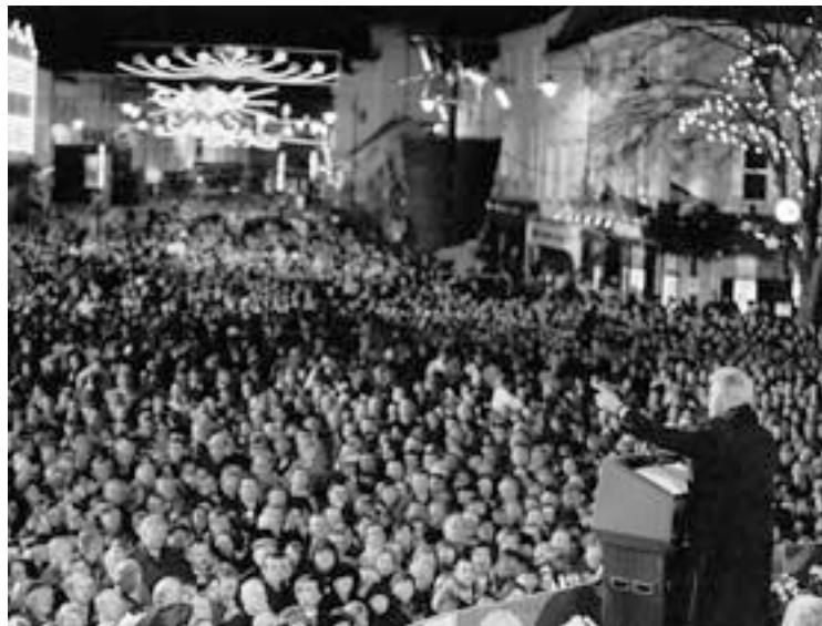
Addressing a crowd in Market Square, Dundalk, Northern Ireland