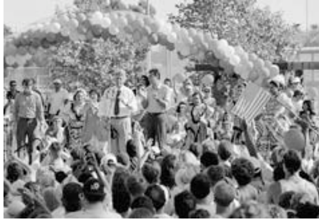
Cinco de Mayo