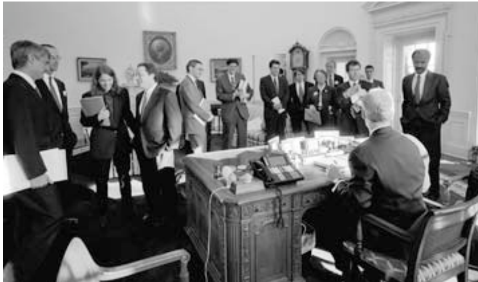
With the economic team in the Oval Office