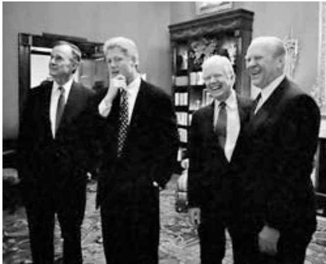
In the residence private study, with Presidents George Bush, Jimmy Carter, and Gerald Ford on the eve of the announcement of the campaign for NAFTA