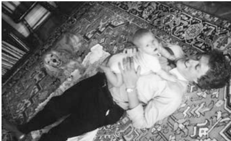
With Chelsea and Zeke