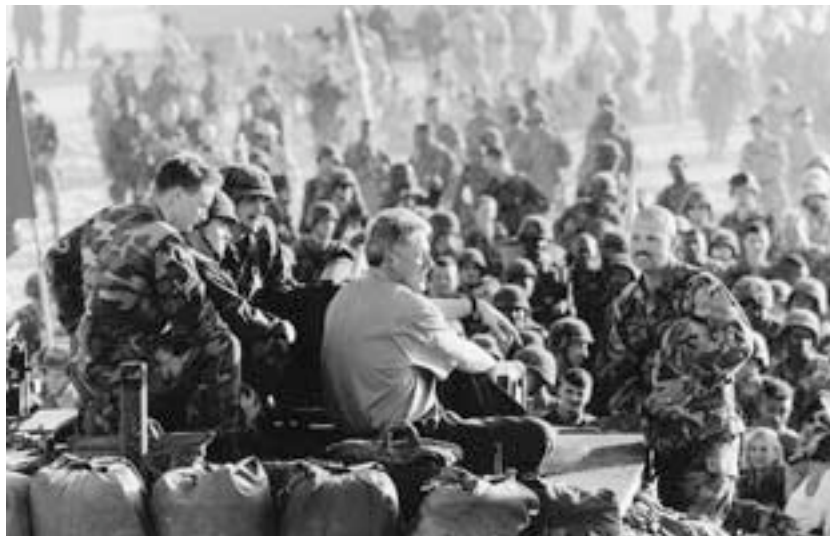
Visiting with the troops in Kuwait