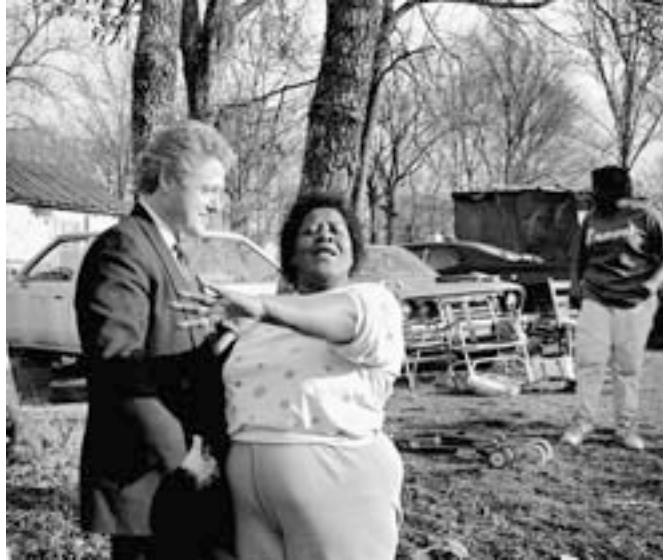
Campaigning in Stone Mountain, Georgia