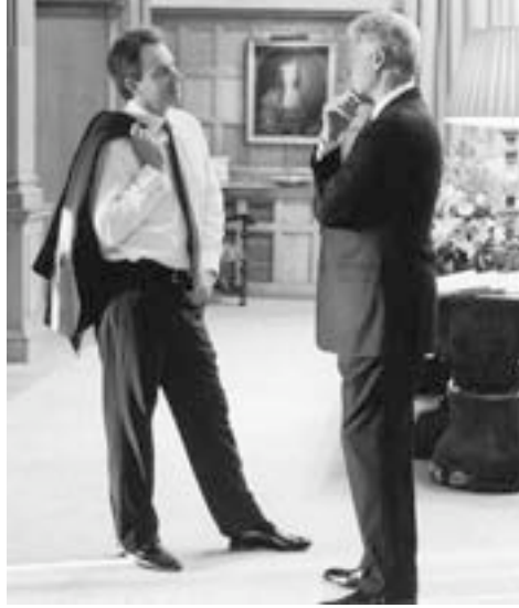
With Tony Blair at Chequers