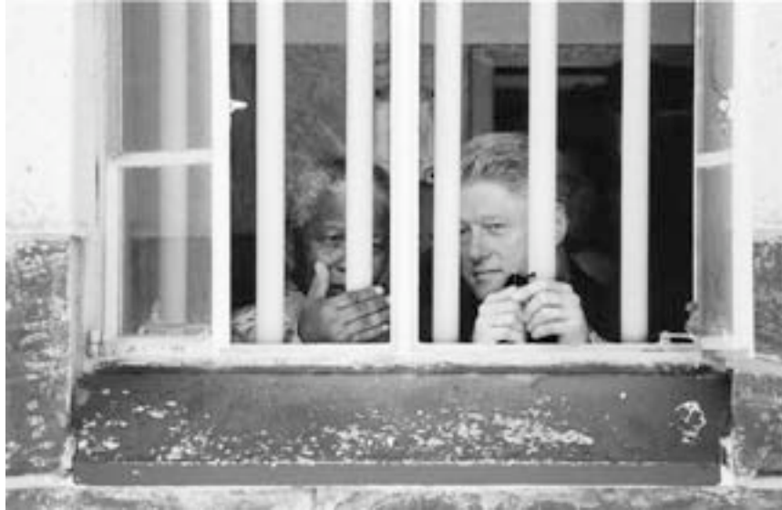
South African president Nelson Mandela and I in the cell on Robben Island, where he had spent the first eighteen of his twenty-seven years in captivity