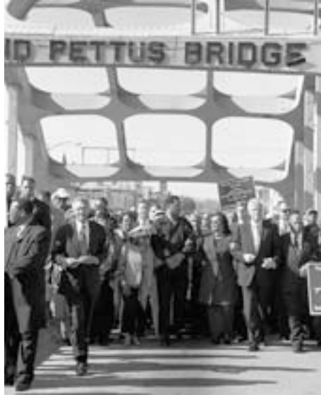
Commemorating the thirty-fifth anniversary of the voting rights march in Selma, Alabama, by crossing the Edmund Pettus Bridge with Jesse Jackson, Coretta Scott King, John Lewis, and other veterans of the civil rights movement who had marched arm in arm with Martin Luther King, Jr.