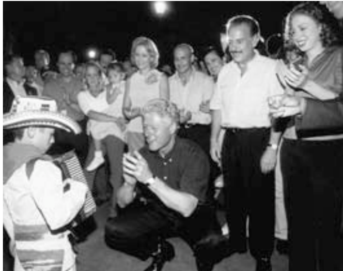
The Vallenato Children performing in Cartagena, with Chelsea and the president of Colombia, Andrés Pastrana