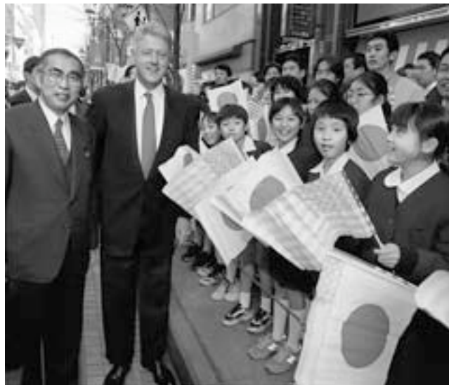
With Japanese prime minister Keizo Obuchi in Tokyo