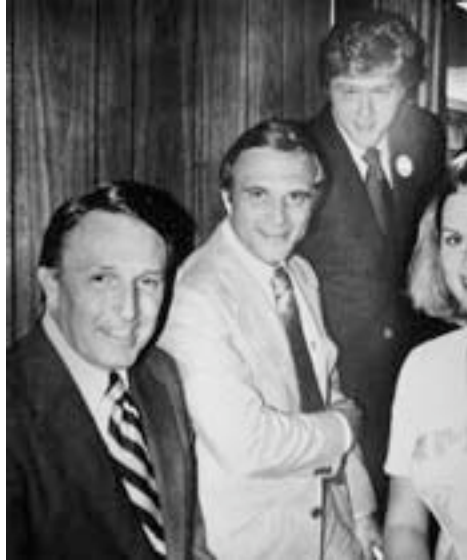
Campaigning with my gubernatorial predecessors Dale Bumpers and David Pryor