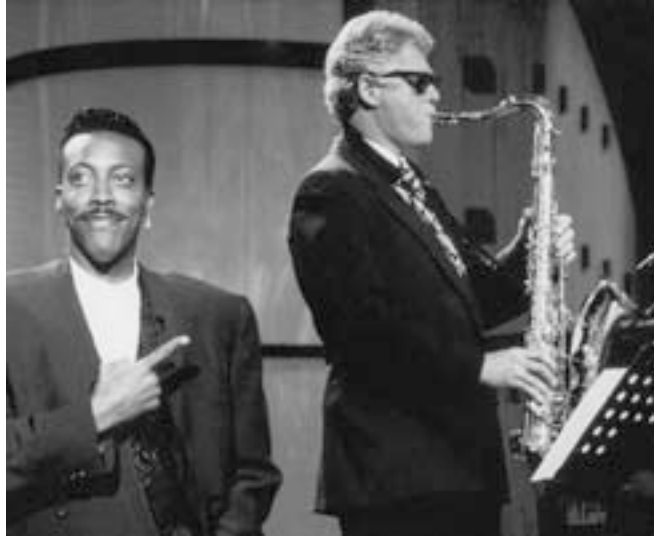
The Arsenio Hall Show