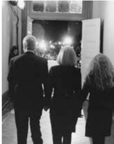
Election night, November 3, 1992