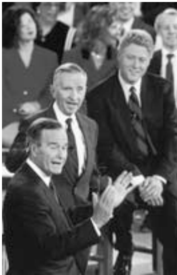
President George H. W. Bush, Ross Perot, and I at the University of Richmond debate