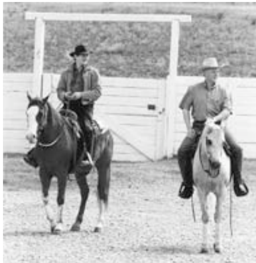
Riding with Harold Ickes in Montana