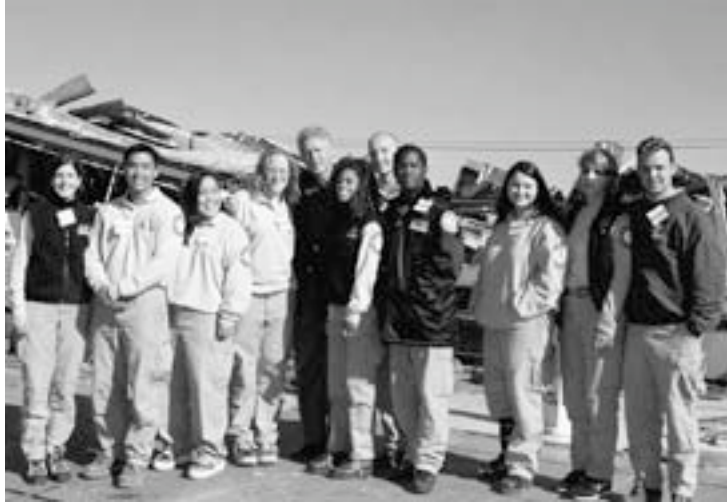
With AmeriCorps volunteers at a tornado site in Arkansas