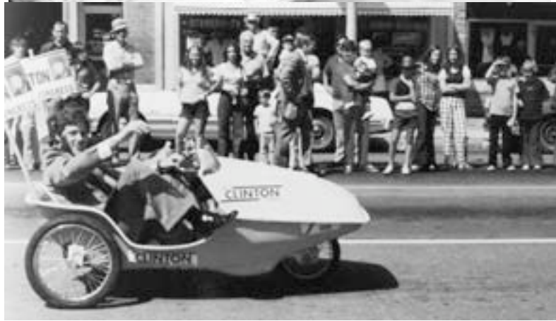
Campaigning for Congress, 1974