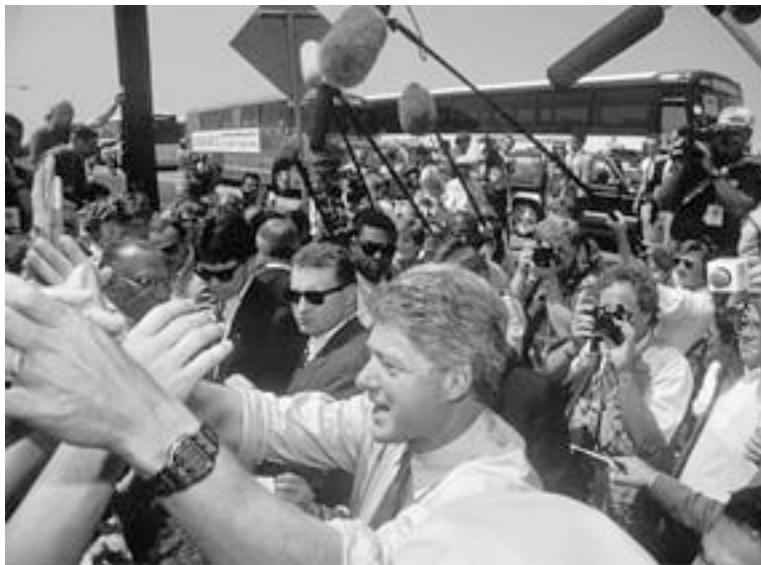
The bus tour