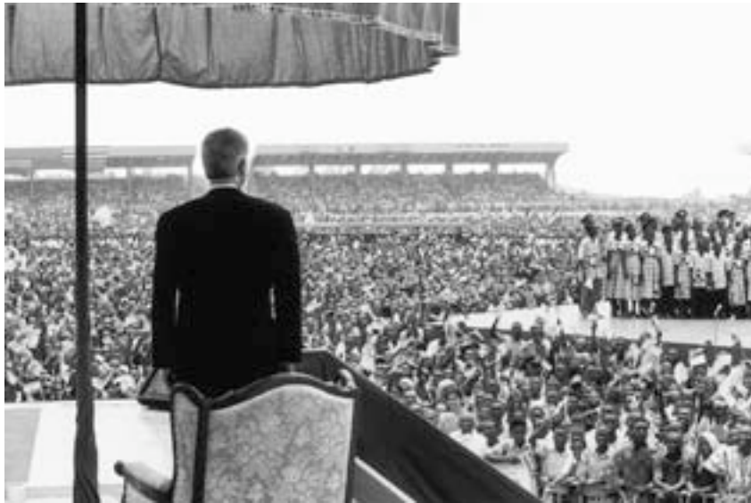
Addressing a crowd of more than 500,000 in Independence Square, Ghana