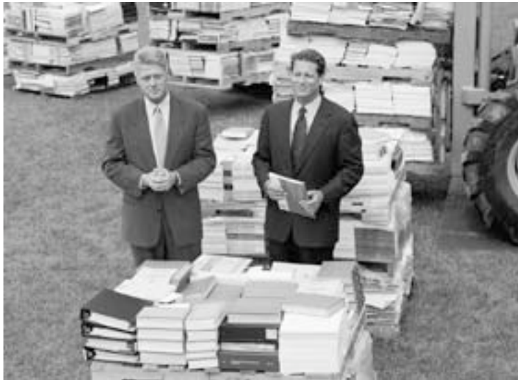
Al and I, on the South Lawn, announcing the elimination of forklifts of government regulations, part of our Reinventing Government initiative