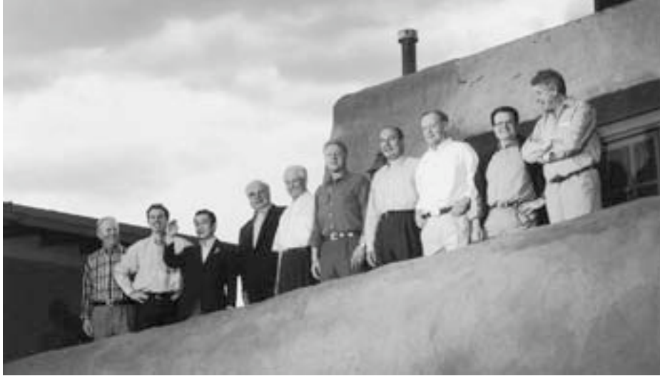
The G-8 meeting in Denver: (left to right) Jacques Delors, Tony Blair, Ryutaro Hashimoto, Helmut Kohl, Boris Yeltsin, me, Jacques Chirac, Jean Chrétien, Romano Prodi, and Wim Kok