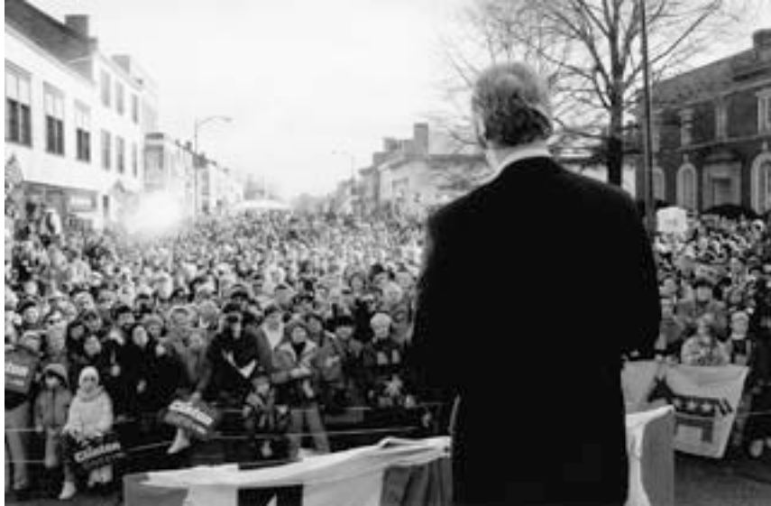
Tipper Gore took this picture of the huge crowd in Keene, New Hampshire