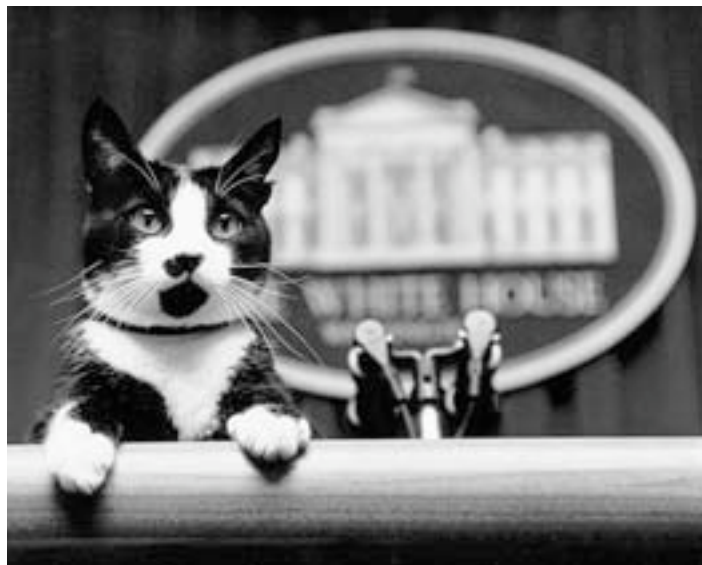
Socks briefing the press