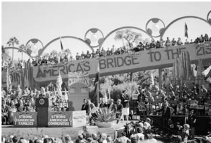
Speaking about America's bridge to the twenty-first century at Arizona State University