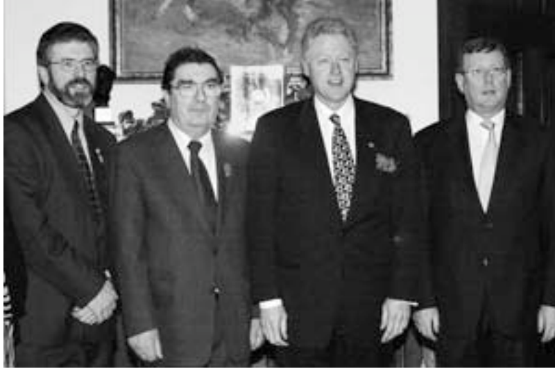
With Gerry Adams, John Hume, and David Trimble on St. Patrick's Day 2000