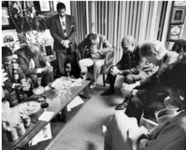
At a prayer meeting after the Los Angeles riots