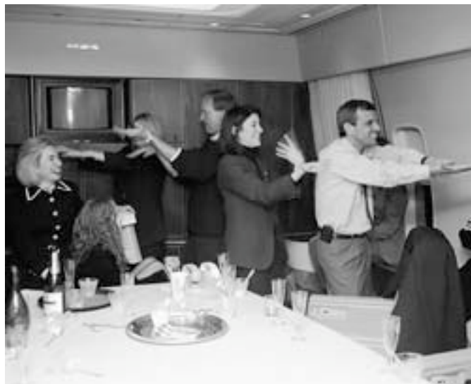
Celebrating our 1996 victory aboard Air Force One